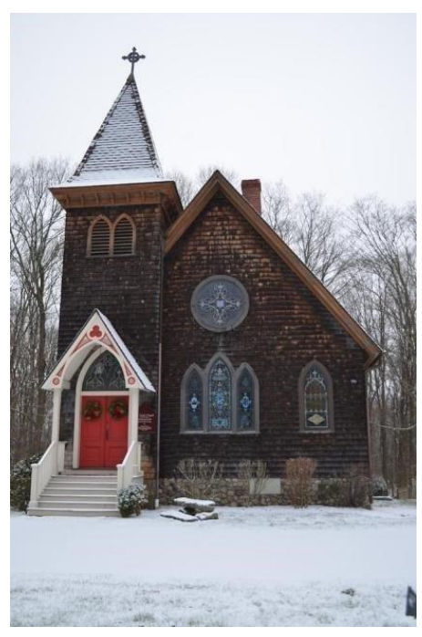
St. John's Church