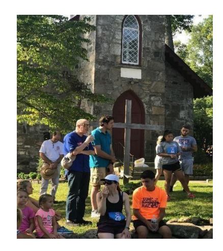
Music is Important to us

Our parishioners value music as part of our worship. Both churches have wonderful acoustics and organs. Although we recently lost our Music Director and organist, we sing a cappella or accompanied by piano and guitars. We always make it work!