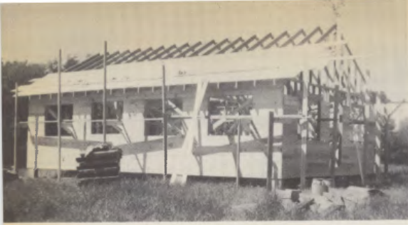
CAMP ST. GEORGE, Parksville, will have a new recreation hall when the above is completed. The camp is operated by St. George's, Newburgh.