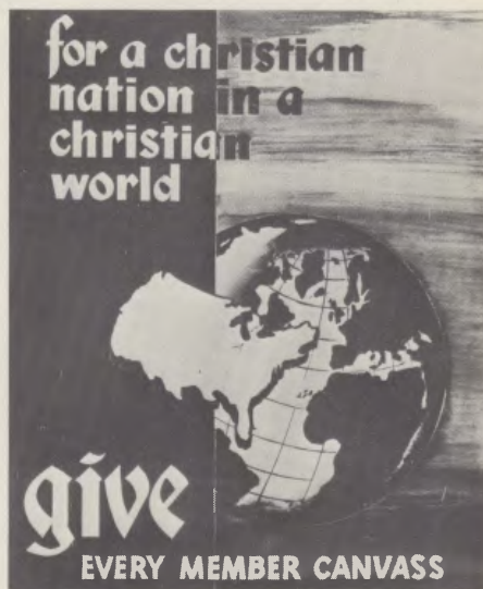
POSTER to be used in the Every Member Canvass this Fall.

The entire group which will number more than 100 men will meet for their