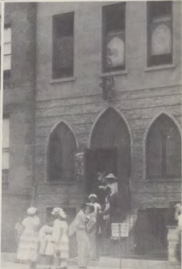
....for a Christian Nation in a Christian World!