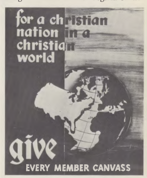
POSTER to be used in the Every Member Canvass this Fall.

The entire group which will number more than 100 men will meet for their