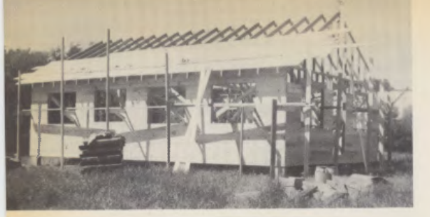
CAMP ST. GEORGE, Parksville, will have a new recreation hall when the above is completed. The camp is operated by St. George's, Newburgh.