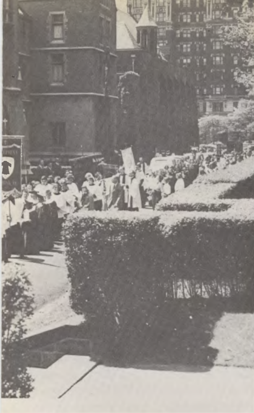
The start of the procession