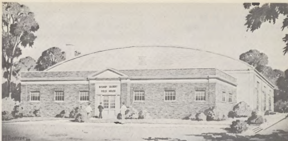
SKETCH of proposed Charles K. Gilbert Field House, St. Peter's School, Peekskill.