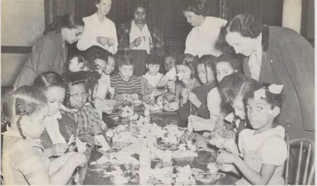
G.F.S. girls at St. Luke's, Convent Avenue make paper flowers.