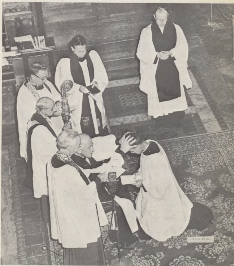
The Bishop ordaining one of the deacons at the ordination service, June 4th.