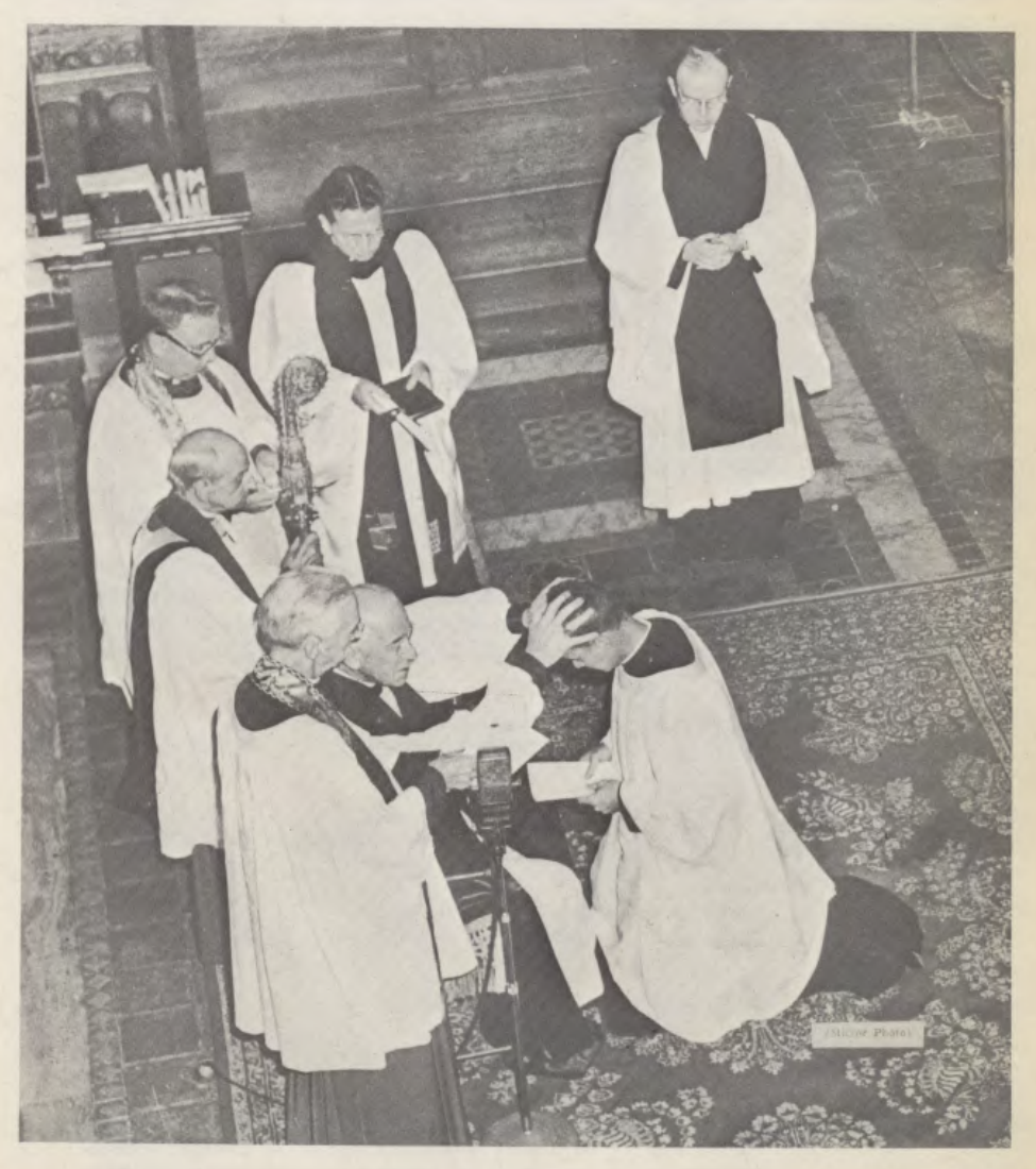
The Bishop ordaining one of the deacons at the ordination service, June 4th.