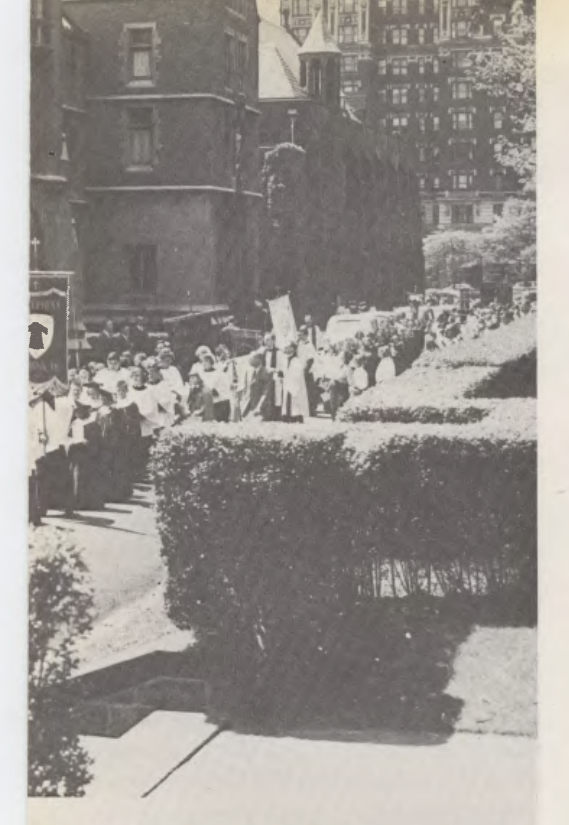
The start of the procession