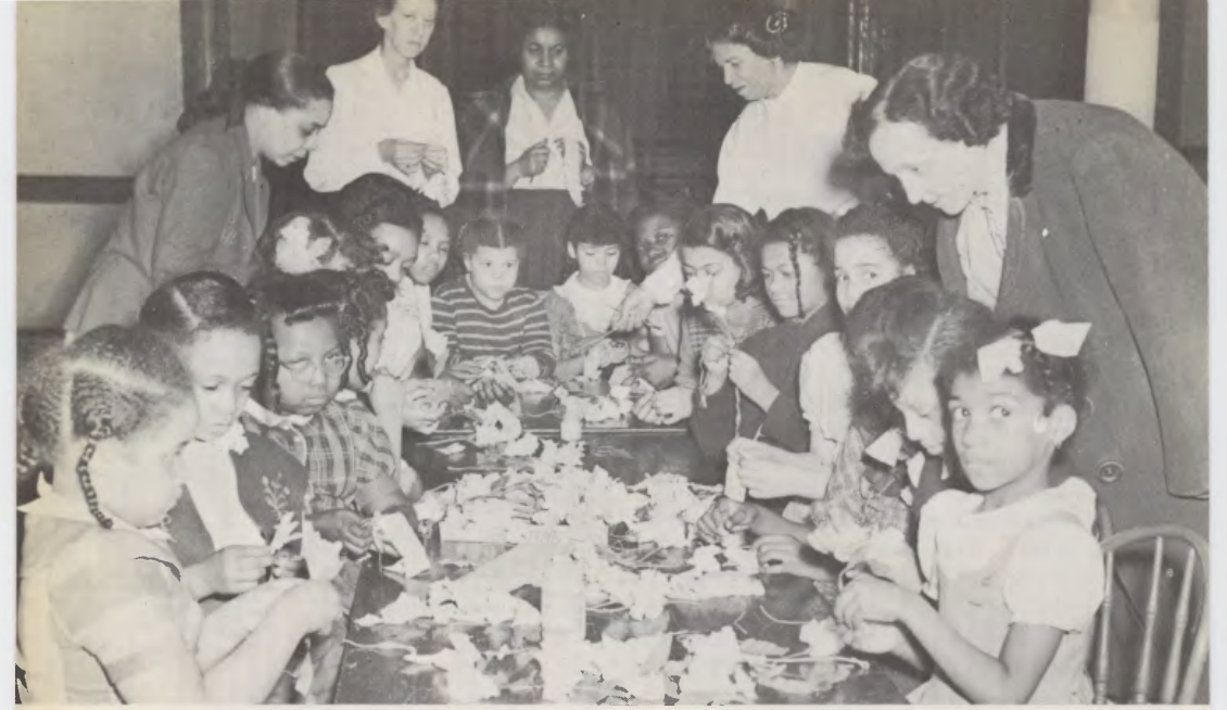
G.F.S. States Racial Policy for Branches

A re-statement of policy in race relations was issued by the national Girls' Friendly Society at a meeting of their board of directors last month. The board said, "This restatement does not in any way alter previous policy but expresses it in terms of the organization's present day program for girls; as well as the Church's stand on human rights." It provides: