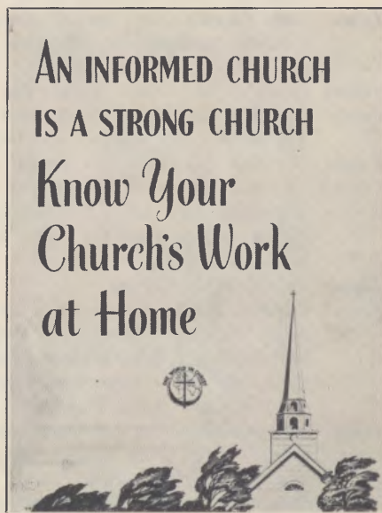
POSTER from National Council emphasizing the need for knowing about and supporting Domestic Missions.