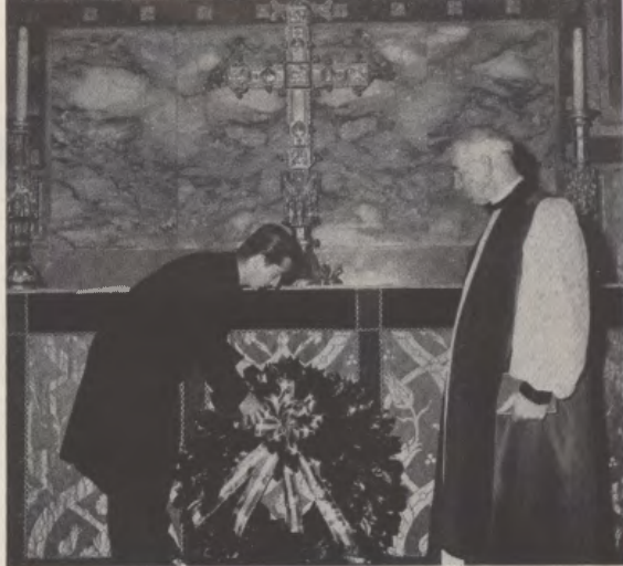
CATHEDRAL: H. M. King Peter II of Yugoslavia deposits a wreath in St. Saviour's Chapel in memory of the late Bishop Manning, saying, "the Bishop was a great friend of my country." The Bishop, having offered prayers, looks on.