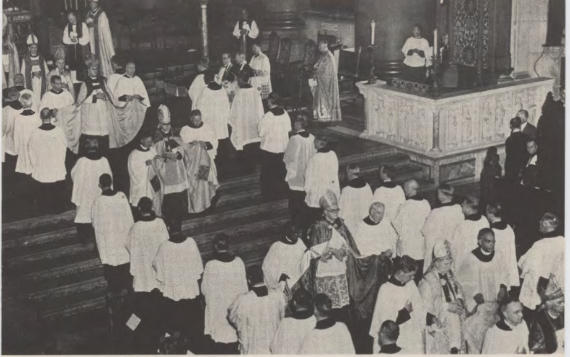
The end of the procession leaving the sanctuary in reverse order after the opening service of the American Church Union celebrating the 400th anniversary of the Book of Common Prayer at the Cathedral, Sept. 15.