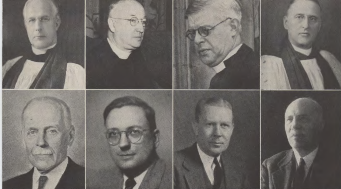
(See box below identification)