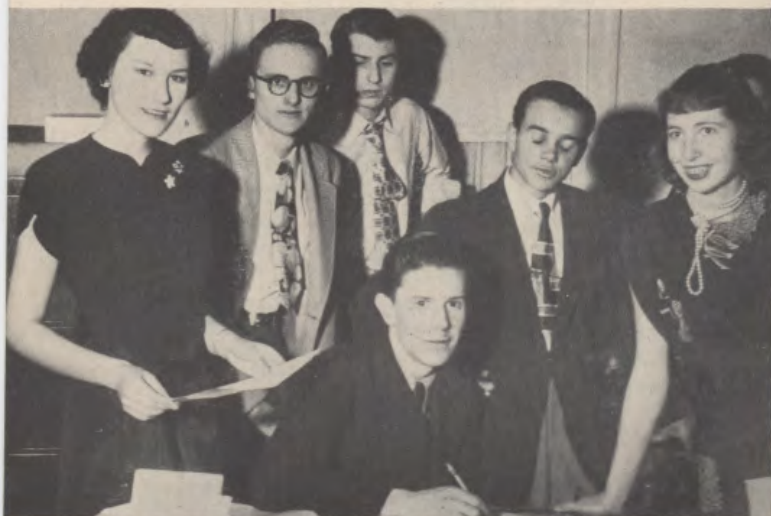
STAFF of "Manners and Morals," a monthly youth publication of the Episcopal Young People's Fellowship, St. Peter's, Westchester, put out for the Convocation of the Bronx. (Above)