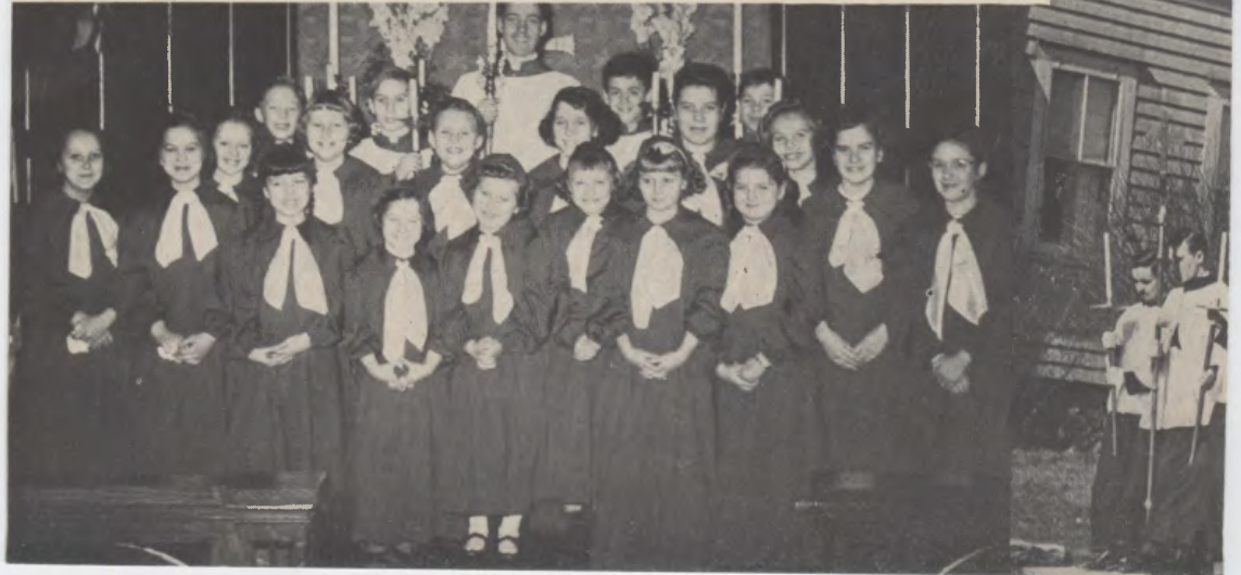
ST. SIMEON'S Junior Choir poses after their new robes had been dedicated recently at the Bronx Church. (Below)