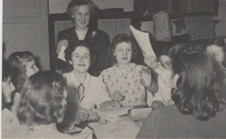
GIRLS' FRIENDLY SOCIETY of St. James', Fordham, fold the parish leaflet.