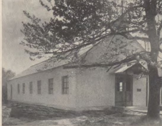
FINISHED pre-engineered church in New Jersey.

neighborhood who now hang around the streets because there is no other place to go. And last but not least, we need that 50 x 100 parish hall for various entertainments to raise money to make up the difference between pledges and the budget." The vicar appended a postscript: