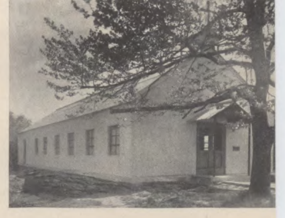
FINISHED pre-engineered church in New Jersey.

neighborhood who now hang around the streets because there is no other place to go. And last but not least, we need that 50 x 100 parish hall for various entertainments to raise money to make up the difference between pledges and the budget." The vicar appended a postscript: