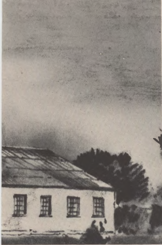
General style of "pre-engineered" church