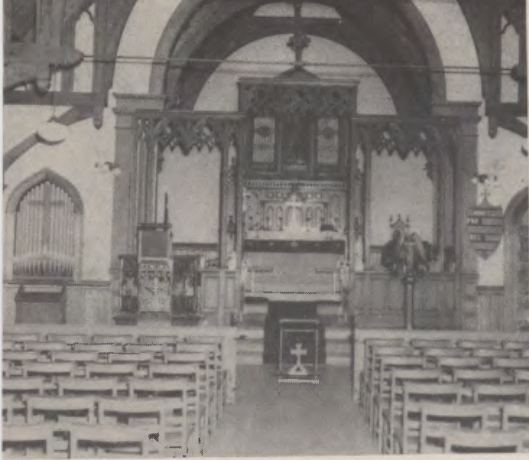
Interior of St. Andrew's, Beacon, consecrated last month