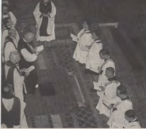
THE BISHOP reads the vows to the six deacons to be advanced to the priesthood.