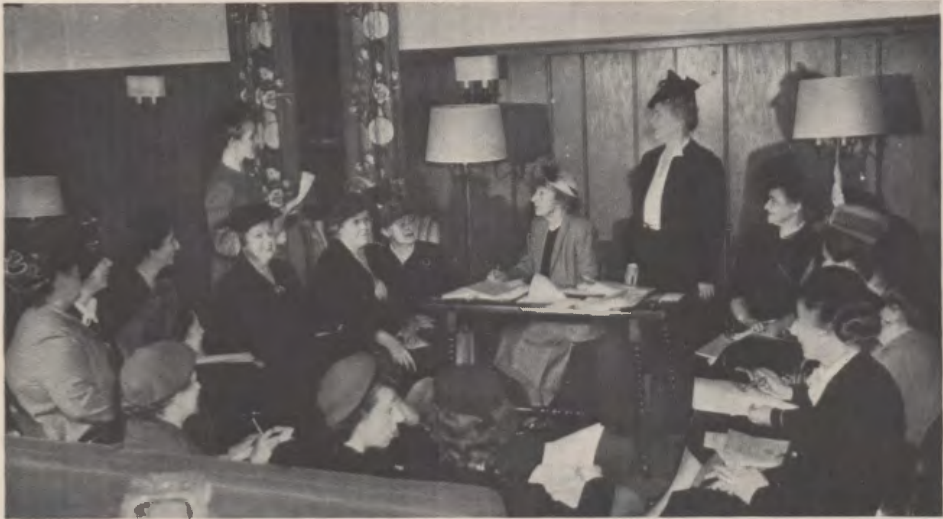
Board of Diocesan Woman's Auxiliary