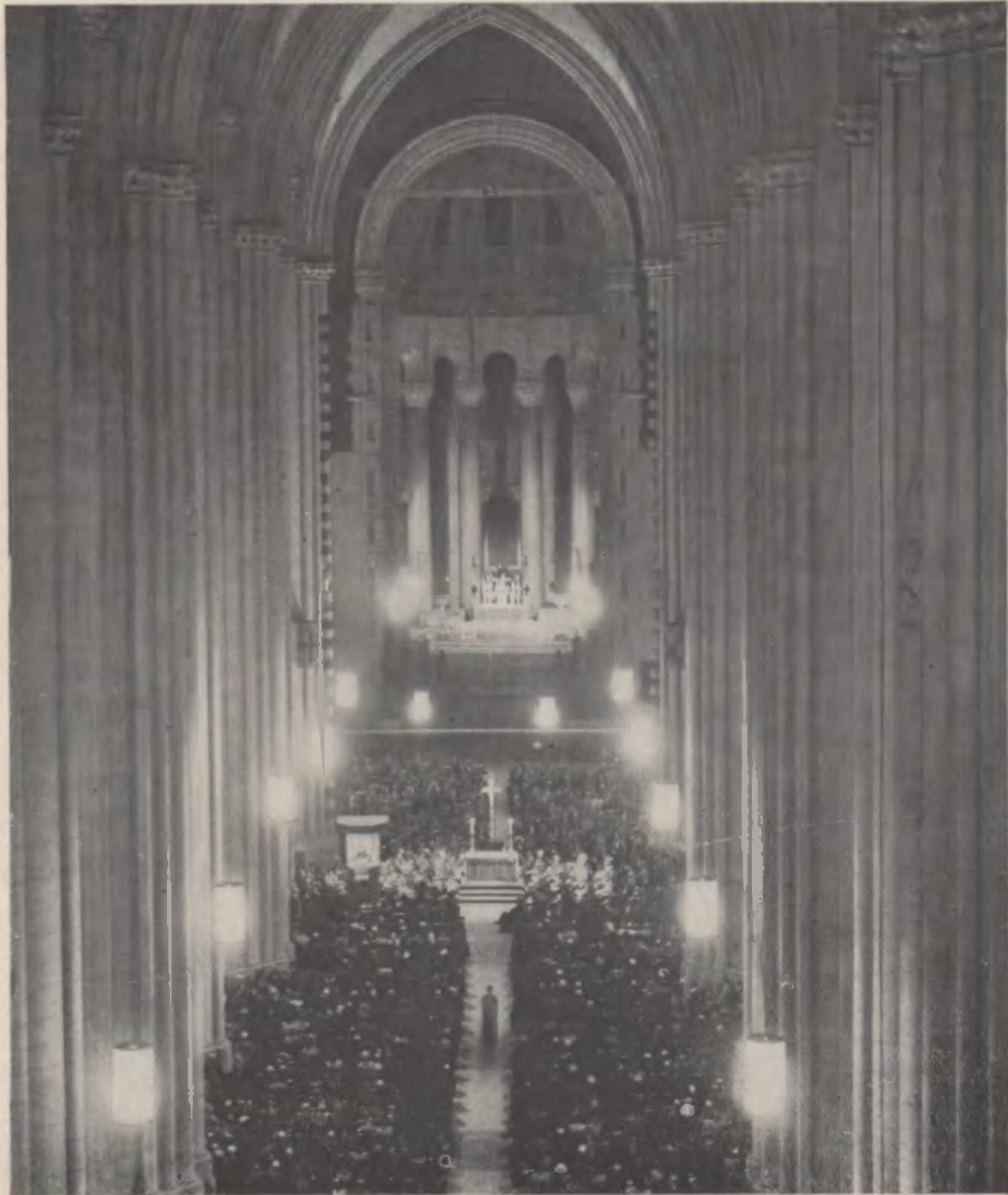
Portion of the crowd of over 7,000 at opening of the Cathedral Diocesan Mission. Crowds jammed sides and back. It was reported 1,000 were turned away.