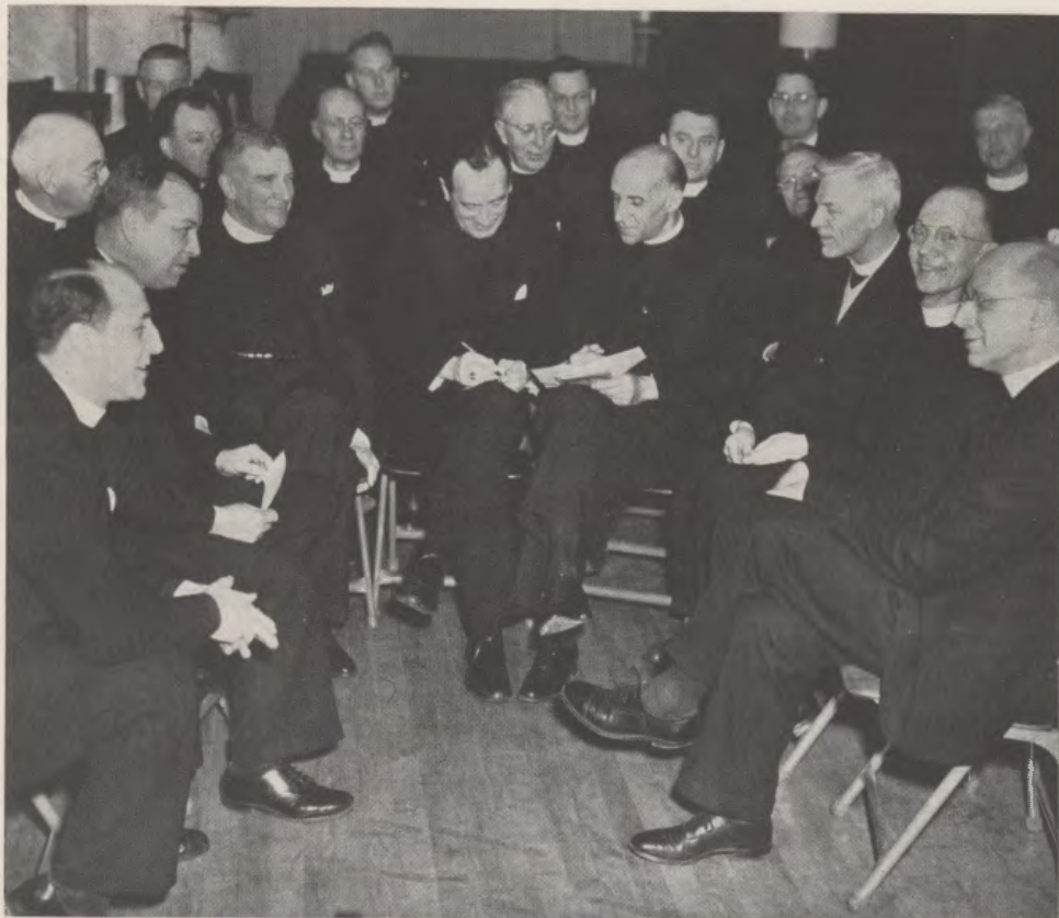
Evangelism Program planning of Manhattan clergy at St. Mary the Virgin.