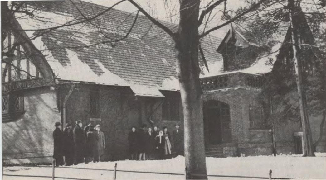
Grace Hall Mission at Crotonville