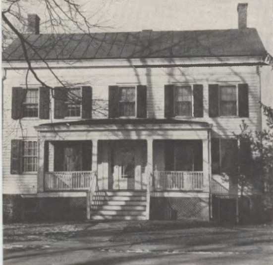
New Rectory at Stone Ridge, N. Y.