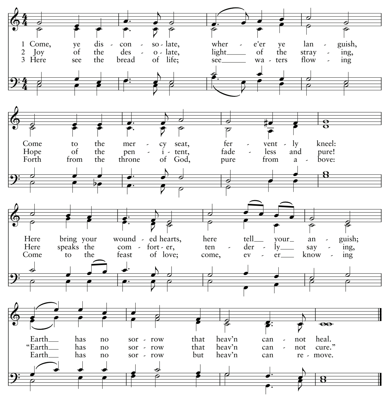
Words: Thomas Moore (1816, rev. 1824); (st. 3):Thomas Hastings (1832) Music: Samuel Webbe (1790)