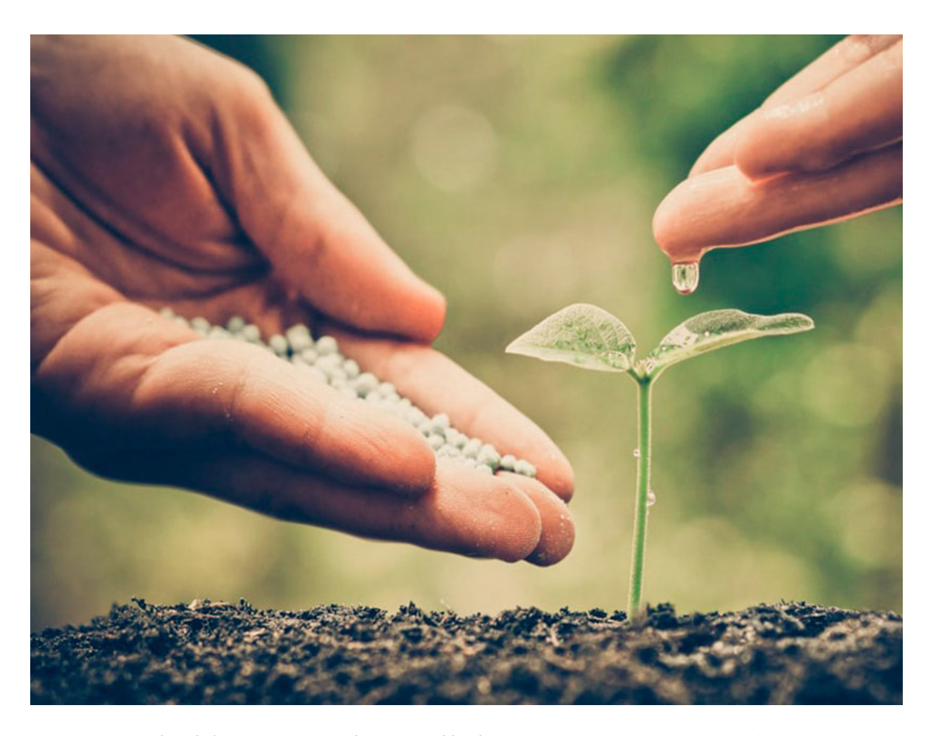
Behold, I am making all things new! (Revelation 21:5b)